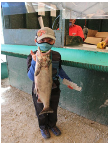
A Young Derby Entrant

THE CLUB HOUSE is: on the Lincoln Park Road, in the township of Georgian Bluffs, or {082535 Side Road 6}, or {217567 Concession 3 Side road, behind Gord Maher Centre}