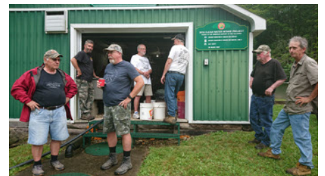
Recent fish stocking