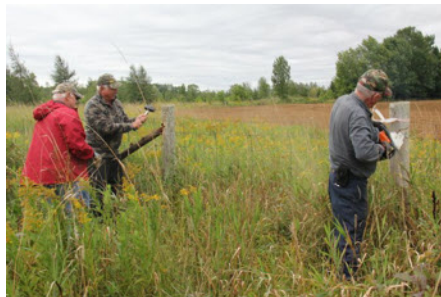
Making an opening in a fence for deer to get through

You know when you are older when you bend to tie your shoelaces and wonder what else you can do while you are down there!