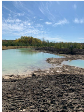
New wildlife pond at Walker Wetland