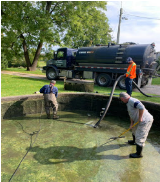
Kidney Pond at Hatchery

Recently the Truvisit Chervil spray has been purchased and picked up. This will be used on the Demonstration Wildlife Management Area beside the SSA property.