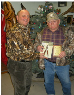
One of the Nibble Night Winners